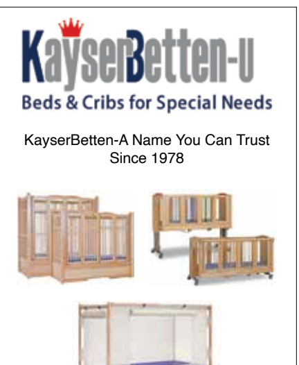
A complete line of beds with innovative designs and unique features. See the difference!