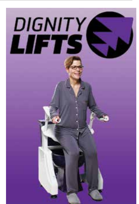
Deluxe Toilet Lift - DL1 <sup>$</sup>1799<sup>.00</sup> www.DignityLifts.com